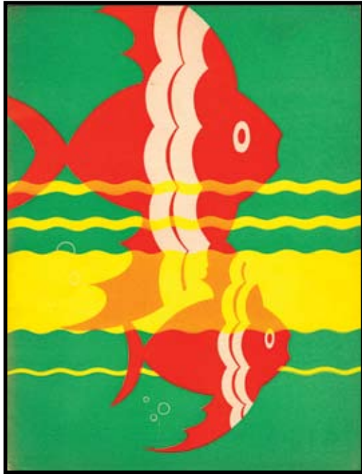
Item 41. Color Printing. Berté.